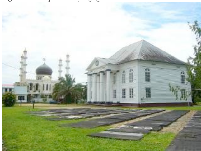
Figure 2: Mosque and Synagogue in Paramaribo