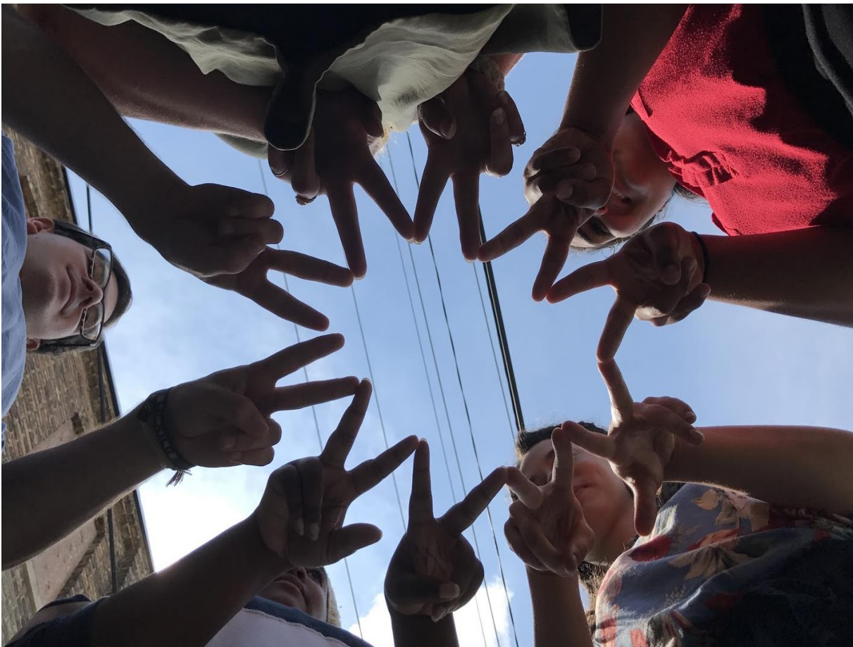
BCe2 Ethnographic Team 2017