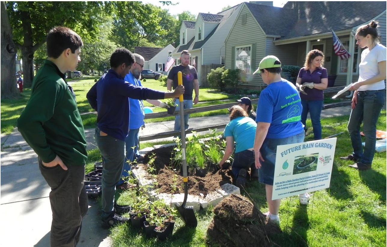
Bowman Creek Educational Ecosystem (BCe2) internship team creating a new rain garden, 2017

formed the basis for our research among the BCe2 organization in the first summer extending to community advocacy outreach in the following summer of 2017.