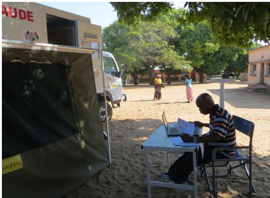
Rapid Ethnographic Assessment of planned mobile health clinics in Mozambique, 2013

literature. Given the above critiques, however, we needed another rubric to modify. Certainly, we expected that pre-existing ethnographic rubrics would be available for assessing decades of anthropological engagement with projects that demand deliverables.