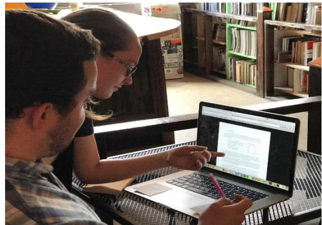
BCe2's Collaborative "informal place-based learning in an authentic environment" South Bend 2017

Collaborative Ethnographic Assessment (CEA) recognizes the limited timeframes and pressing issues of contemporary ethnographic research. Each annual reformation of BCe2's ethnographic team conducts their work within the constraints of the ten-week summer internships. The inaugural 2016 team focused on the project proposal's three research questions, quickly confirming many of the more binary STEM-based outcomes (Blum, Barnes, Huggins & Haanstad, 2018). For example, the nearly rhetorical second research question, "Does this experience build the 21 st Century skills needed for STEM professionals?" was demonstrated in the first project team meeting. Part of that same question, "What factors facilitate or inhibit positive collaboration?" offered a more open-ended opportunity for ethnographic exploration (Brockman et al., 2016). The 2017 team built on these holistic explorations by focusing more specifically on community collaboration. The 2018 team continued to highlight collaborative engagement while building its capacities for neighborhood advocacy and community liaisons.